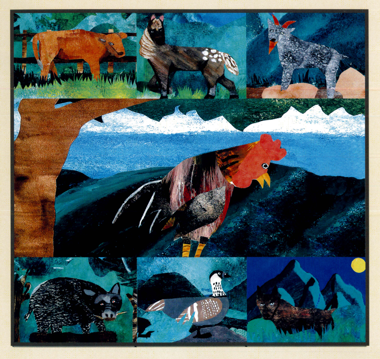
Written and Illustrated By Ikaika Alani