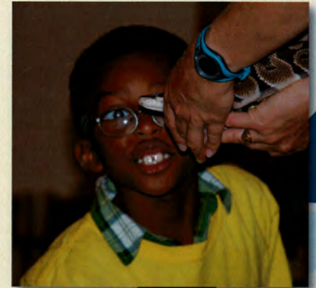
Student captivated by the life of a snake.

Our pet corn snake, Jewels, is 21 inches and 1 year old. We measured her shedded skin to find out how long she was. Corn snakes can live up to 20 years old. The world record for the longest corn snake is almost 6 feet long!