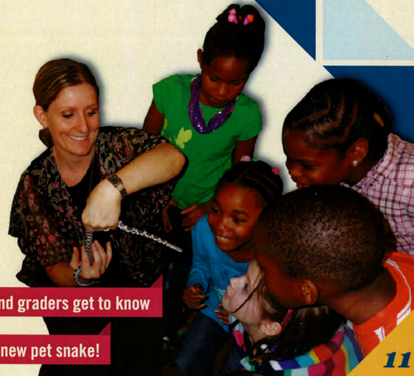
Second graders get to know