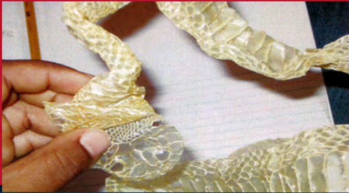
Corn snakes shed their skin to keep growing.

A corn snake grows by eating mice and shedding. It sheds because its old skin gets tight like a tight shirt. What happens when a corn snake sheds is: first the corn snake's eyes get milky white — then it rubs its nose on something firm — then the corn snake wiggles around and the skin comes off and goes inside out. How often they shed depends on their age — old snakes grow less than young snakes so old snakes shed less. Another word for shedding is molting.