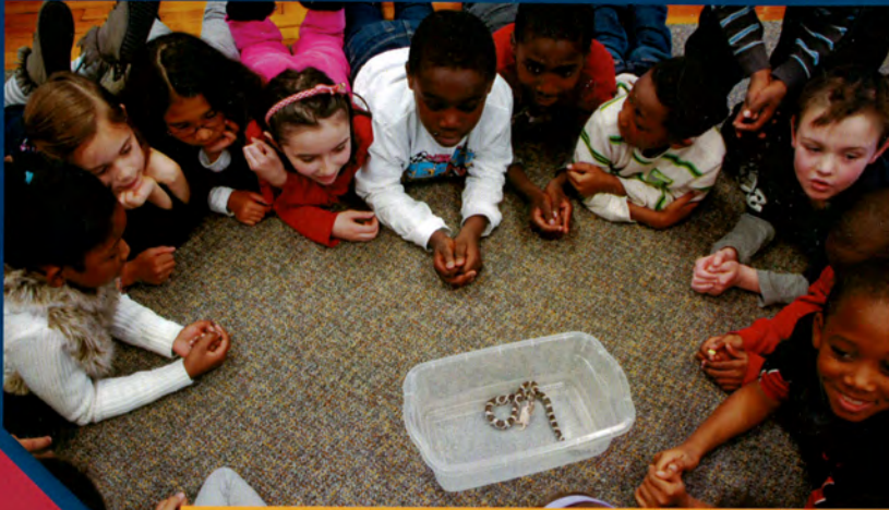
2 nd graders with their pet corn snake, Jewels.

25 ARLINGTON STREET BRIGHTON, MA 02135 T: 617.254.8904