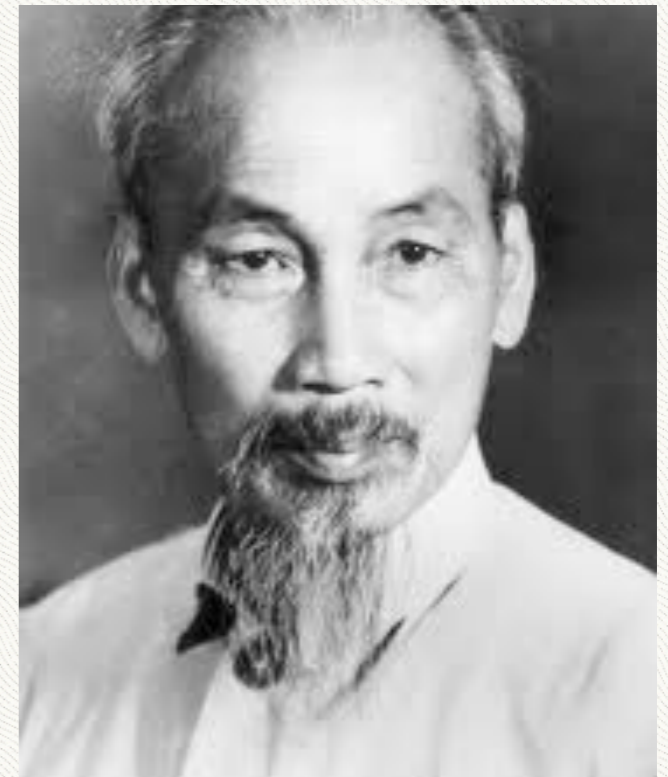
Ho Chi Minh led a Communist government in the North.